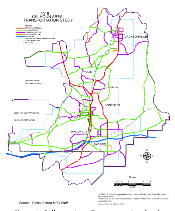
Figure I: Calhoun Area Transportation Study

The Calhoun Area MPO consists of 19 representatives from 5 municipalities and 1 county, Alabama Department of Transportation (ALDOT), Federal Highway Administration (FHWA), Federal Transit Administration (FTA), and the East Alabama Regional Planning and Development Commission (EARPDC).